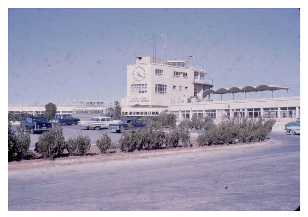
Figure 4. A photo of the terminal building taken a few months after the 1967 war, in November 1967.

or regional instability, it remained a major gateway to Jordan. Humble infrastructure and political constraints may have limited the number of airlines and size of aircraft serving it. Nevertheless, it was the first time – and so far, the last – that Jerusalem enjoyed a regular, civilian-oriented connection by air to the outside world.