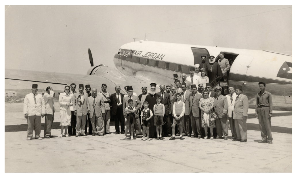
Figure 1. Jerusalem Mayor, Omar al-Wa'ary, awaiting diplomatic visitors to Jerusalem at the airpot in 1954.

construction of a new terminal building and parking lot was completed in 1956.<sup>11</sup> A recommendation by a British consultancy firm in 1960 to extend the runway twice more to 2,250 meters and 3,000 meters was adopted but not acted upon right away. In early 1962, the International Civil Aviation Organization conducted a technical feasibility study for construction of Jerusalem International Airport,<sup>12</sup> but the study's results are unknown. The airport underwent a series of improvements towards its passenger facilities in mid-1966; in 1967 works to lengthen the runway were interrupted by the 1967war.<sup>13</sup>