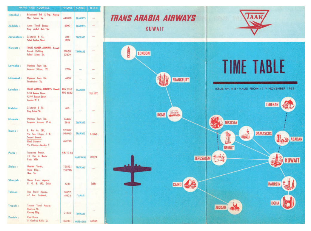
Figure 3. Trans Arabia Airways Kuwait (TAAK), 17 November 1963 timetable, Airline Timetable Images Website, online at www.timetableimages.com/ttimages/kt3/kt6311/kt6311-1.jpg (accessed 17 October 2020).

weekly by early 1963.<sup>65</sup> A second Kuwaiti airline, Trans Arabia Airways, offered four weekly flights between Kuwait City and Jerusalem (two in each direction) in 1963, before being absorbed by KA in April 1964.<sup>66</sup>