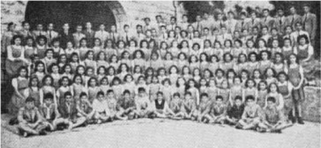
Ramallah Chorus. Friendly Flashes Newsletter , September 1941.