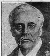
لورد بلور صاحب الوعد المشؤوم

"His Majesty's Government view with favour the establishment in Palestine of a national home for the Jewish people, and will use their best endeavours to facilitate the achievement of this object, it being clearly understood that nothing shall be done which may prejudice the civil and religious rights of existing non-Jewish communities in Palestine or the rights and political status enjoyed by Jews in any other country."