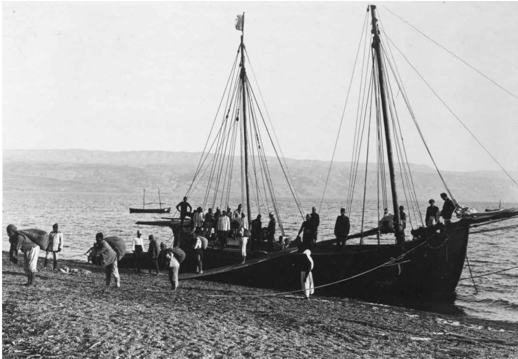
Transporting grain from the Dead Sea.