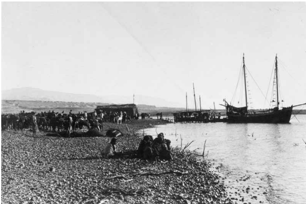
Unloading grain on the north shore, Matson collection, Library of Congress.