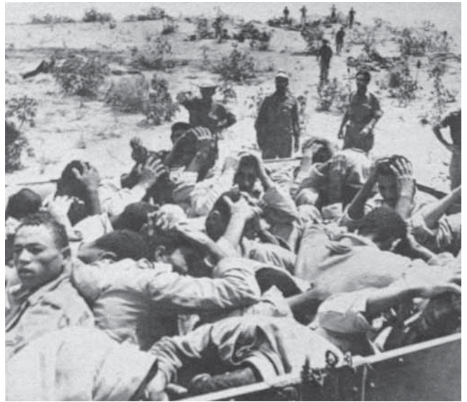
"Egyptian prisoners being trucked to the rear."

the wounded to safety went from a staid image of quiet determination in 1948 to one of agony and haste in 2000 (for a good example of the same subject see Time , 23 October, 2000, p. 36). The intensely-detailed clarity of higher resolution film, digital files and reproduction technologies, realistic colours, and use of a wide angle lens give recent photographs an immediacy and sense of intimate involvement lacking in the one taken in 1948. With cameras that focus automatically and shoot rapid-fire, and (since the 1970s) long lenses that can isolate a subject in the frame from a great distance, there is now no reason not to capture the anguished expression of the wounded that was not at all visible in the 1948 photograph.