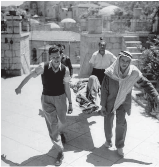
Photo from Life , 7 June, 1948, p. 43. "Wounded Arab Legionnaire is carried by civilian volunteers, May 1, 1948". Photo by John Phillips/Time & Life Pictures/Getty Images.

photograph as its forces took control of the Old City of Jerusalem. While Time published text with occasional, small photos for illustration, Life emphasized pictures as the most important source of information, often spreading photos across two pages. A double-page spread of several photos in the 7 June, 1948 issue starts on the upper left with Arab Legion trucks advancing along a narrow Jerusalem Old City street. The end frame in lower right shows a wounded Arab Legionnaire being carried away by volunteers. In between are photographs depicting Arab troops crouched with guns and sandbags along the top of an Old City wall, Palestinian civilians crowding together at the Church of the Holy Sepulchre to hear battle bulletins, and explosions around Jewish-held buildings seen from a distance. This simple version of a photo essay presents a narrative of the fight to hold Jerusalem, shot from the Palestinian side.