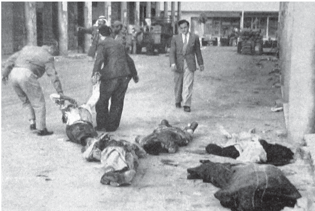
Published in Time, 24 May, 1948, p. 34. Original caption: "Arab dead in Haifa." This photo was taken in the Haifa bus station in April 1948 before the fall of the town to Jewish forces.

particular equipment. These choices are shaped by trends in the professional and social world of photography, technology, markets, and working conditions. Ultimately, style creates meaning and guides audiences in their interpretations.