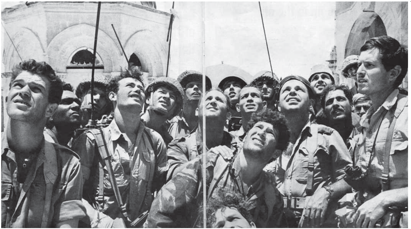
Featured in Life , 16 June, 1967, p. 38B-C. Original caption: "Faces aglow, conquering Israelis stand again inside Old Jerusalem." Taken in the yard of the Haram al-Sharif, Jerusalem's holy mosque.

ultimately leading to the description of their work as 'concerned photography'. They also asserted the importance of being personally invested in their subjects, and were committed to raising the standards of photojournalism as a serious artistic and political practice that rejected cheap sensationalism.