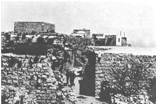
An old black and white of the alleys of Deir Yassin, taken before 1948.

in 1947-49, education, and folklore. The book also contains a number of unique chapters entitled, “marriage and love,” and “getting to know the village of Qaluniya,” a section that includes an elaborately detailed description of the architecture and use of the village house. 18