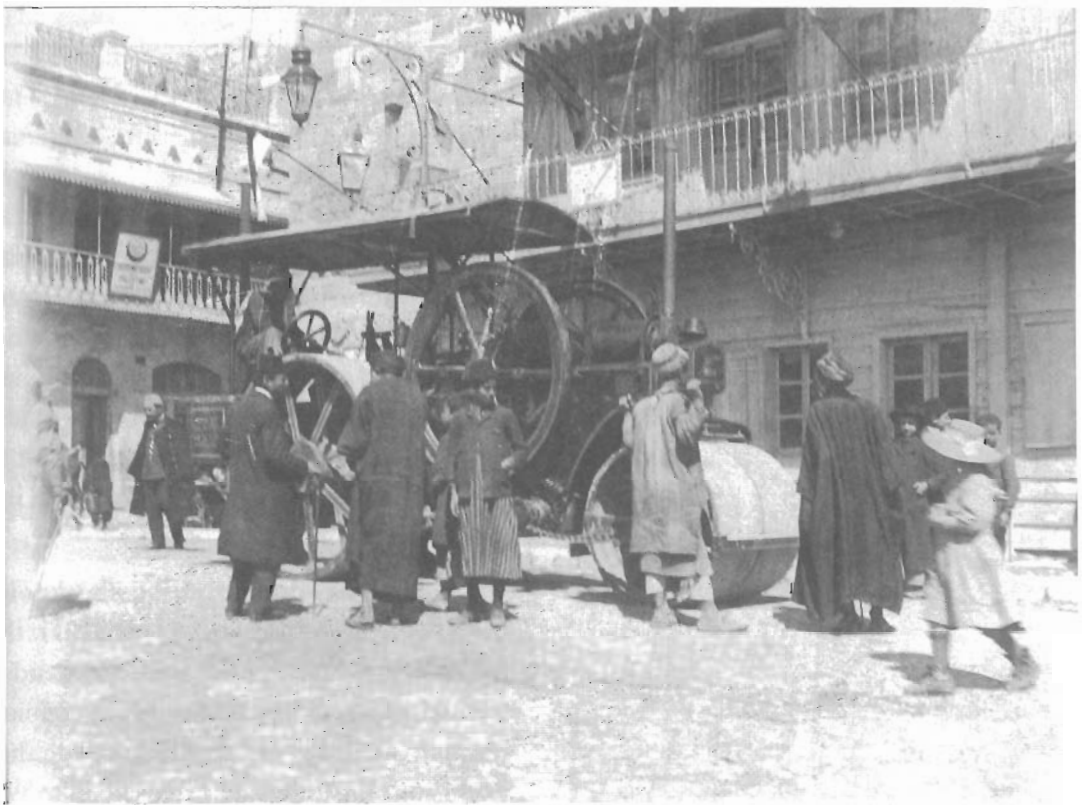
The paving of the new roads in the Old City during WWI.