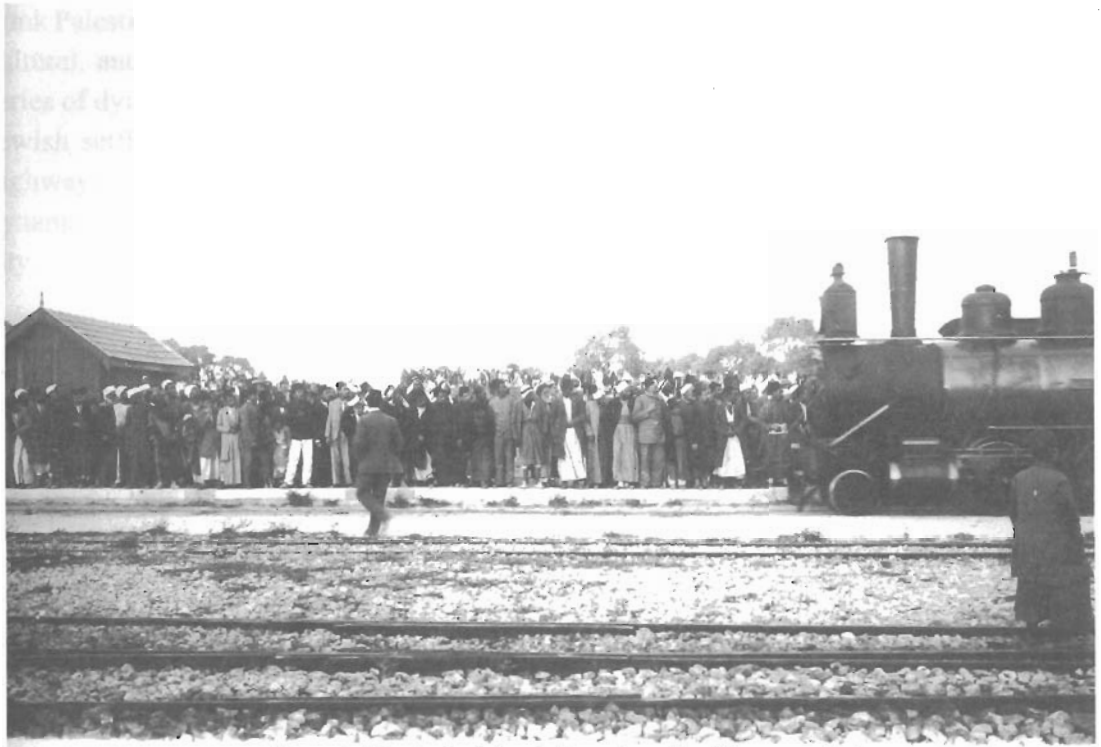
A crowd at the train station in Jerusalem, late Ottoman period.