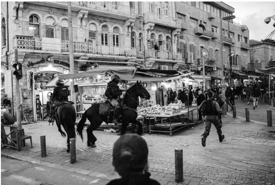
Mounted Israeli security forces patrol al-Aqsa Mosque compound in East Jerusalem following the widespread Palestinian protests against the so-called deal of the century, the Trump administration's Middle East "peace plan." Israeli forces temporarily closed all gates to the compound after arresting two Palestinian teenagers for alleged possession of a knife. (29 January)