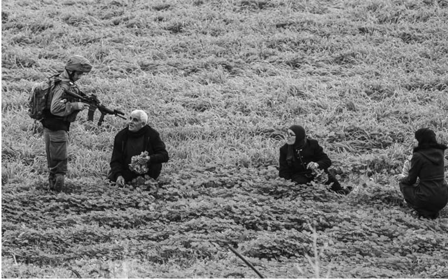
An Israeli soldier trains his gun on a small group of Palestinian farmers as he checks their identification documents in a field near al-Hamra checkpoint in the Jordan Valley. (28 January,)