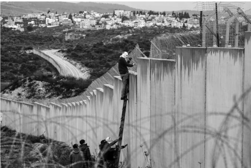
A masked Palestinian in Bil'in, a village near Ramallah, cuts through the barbed wire lining the separation wall with Israel. In the background is Mod'in Ilit, one of the largest Israeli settlements in the West Bank. (7 February)