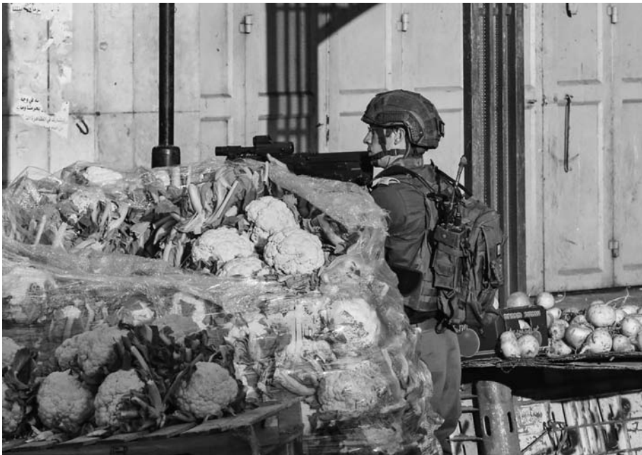
An Israeli soldier aims his rifle from behind a stack of cauliflower in Hebron after a seventeen-year-old Palestinian protester was shot dead by Israeli forces in the city the previous day. Mohammed al-Haddad is thought to be the first Palestinian to have been killed protesting the Trump administration's Middle East "peace plan." (6 February, Hazem Bader/AFP via Getty Images)