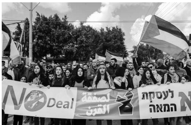
Palestinian protesters in the northern Israeli town of Baqa al-Gharbiyya demonstrate against U.S. president Donald Trump's so-called deal of the century. The Trump administration's "peace plan" has been unanimously rejected by Palestinians (see Palestine Unbound in this issue). (1 February, Ahmad Gharabli/AFP via Getty Images)