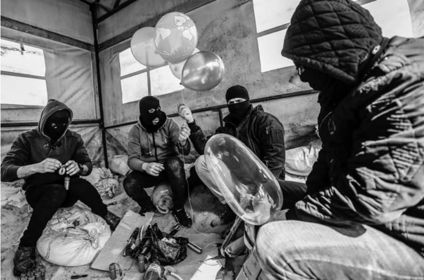
Masked Palestinians inflate balloons and assemble incendiary devices in al-Bureij refugee camp close to the Gaza-Israel perimeter fence. The use of such devices surged after the Trump administration's 28 January announcement of its Middle East "peace plan." (10 February, Mahmud Hams/AFP via Getty Images)