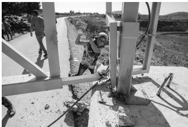
A young Palestinian in Dayr Nizam, a village near Ramallah, tries to break the padlock on a gate blocking the entrance of the village. The gate was installed by the Israeli army to curtail protests against the U.S. administration's Middle East "peace plan," unveiled by the White House on 28 January. (15 February, Abbas Momeni/AFP via Getty Images)

This sample of photos from 16 November 2019–15 February 2020 aims to convey a sense of Palestinian life during this quarter. The images center on the effects of U.S. president Donald Trump's announced Middle East "peace plan," which included widespread protests and increased violence.