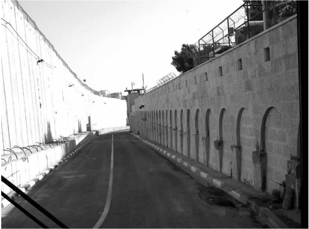
Rachel's Tomb inside the Separation Barrier.

the Israeli-built “separation barrier” was extended into Bethlehem to encompass the Tomb and seal it off from the West Bank, access for Israeli Jews and tourists was also severely restricted when not rendered impossible because of site closure. Before the 2007 completion of the “separation barrier,” which allowed private cars from the Israeli side of the barrier to be driven up to the Tomb, one could only get to Rachel’s Tomb directly from West Jerusalem via either “private bullet-proof buses” 50 provided by groups such as the Mosdos Kever Rachel (Rachel’s Tomb Institute) or by public bullet-proof buses run by Eged .