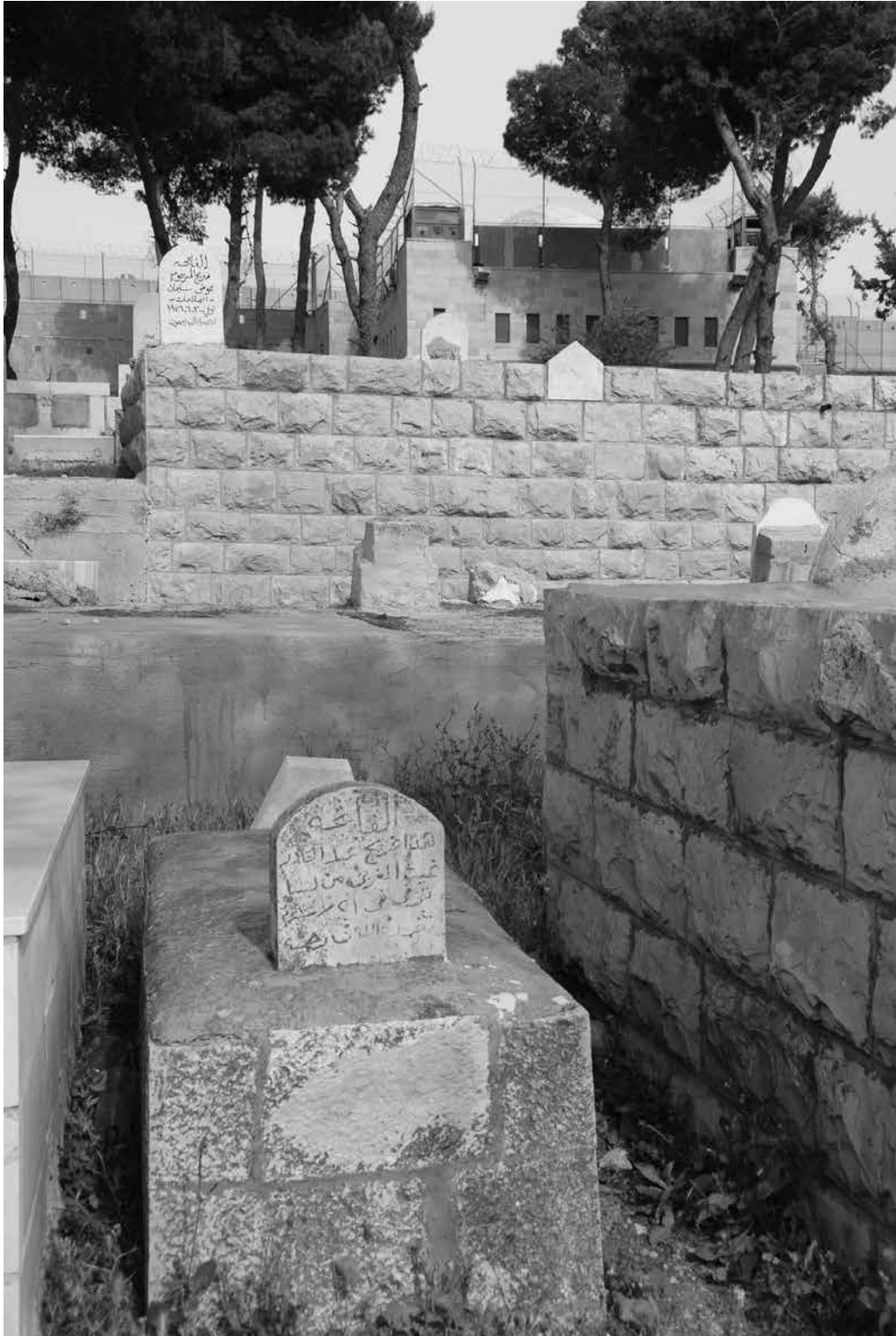
Rachel's Tomb or Bilal bin Rabah mosque, insulated from the Muslim cemetery by the separation barrier. Source: Photo by author, 4 May 2011.