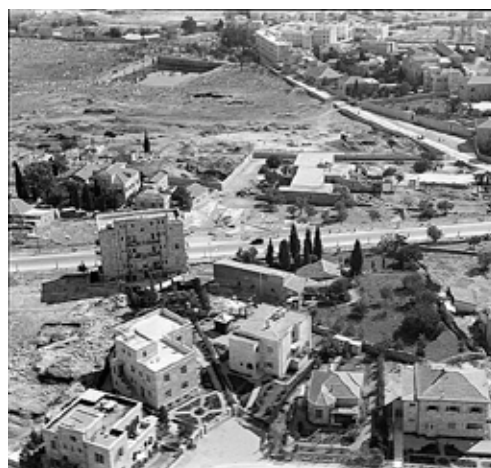
Figure 3. Aerial view, Jerusalem: Rehavia neighborhood and Mamilla Cemetery and Pool, viewed from west, between 1928 and 1946, from the G. Eric and Edith Matson Photograph Collection, Library of Congress, Washington, DC.