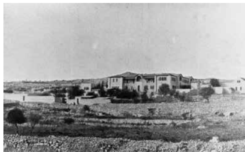
Figure 12: Jesus Hilfe Asyl, year and author unknown, copyright Moravian Church Archives, London.