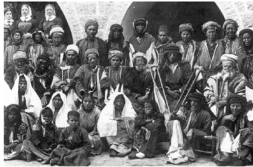
Figure 10. Lepers, Jesus Hilfe Asyl, year and author unknown, copyright Moravian Church Archives, London.