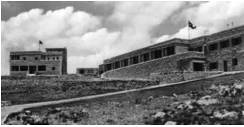
Figure 8. Surda Mountain Leprosarium, year and author unknown, copyright Moravian Church Archives, London.