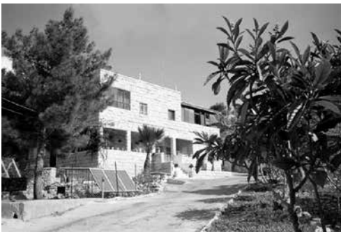
Figure 9. Star (Surda) Mountain Rehabilitation Center, date and author unknown, copyright Moravian Church Archives, London.

Palestinian leprosy patients. As a result of Canaan's research into bacteriology and treatments for leprosy, specifically with gorjun and chaulmoogra oil, iodine and sulphur, there was a strong decline in the numbers of housed lepers. While a few lepers remained at Surda Mountain, in 1974 the Unity Synod decided to repurpose the facility for disabled children in Palestine. In 1979, the last leper left the hospital. Today, Surda Mountain is a school for disabled children and is still run by the Moravian Church.