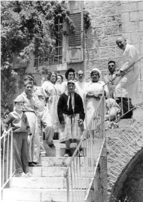
Figure 13: Medical staff at Jesus Hilfe Asyl, year and author unknown, copyright Moravian Church Archives, London.

Arts and Design occupies this space and denies the expulsion – claiming that as a result of the “War of Independence,” staff and patients chose to leave the home. This falsified history acts as a colonial device to feed apartheid. These two leprosaria speak to the extremely traumatic time when the suburbs bordering the Old City, a space co-inhabited by Muslims, Christians, and Jews, was violently occupied in 1948 and to the continued denial and erasure of their true histories.