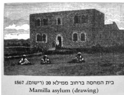
Figure 1. “Mamilla Asylum Drawing,”.