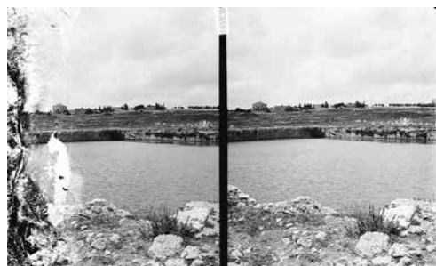
Figure 2. Mamilla Pool, Jerusalem, between 1898 and 1946, from the G. Eric and Edith Matson Photograph Collection, Library of Congress, Washington, DC.