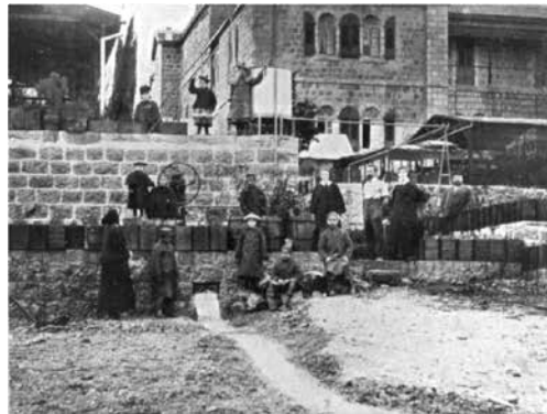
Figure 11: Lepers and water cisterns, Jesus Hilfe Asyl, year and author unknown, copyright Moravian Church Archives, London.