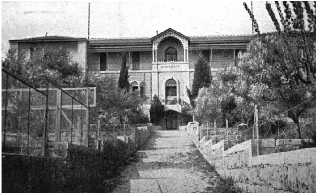
Figure 4. Jesus Hilfe Asyl, year and author unknown