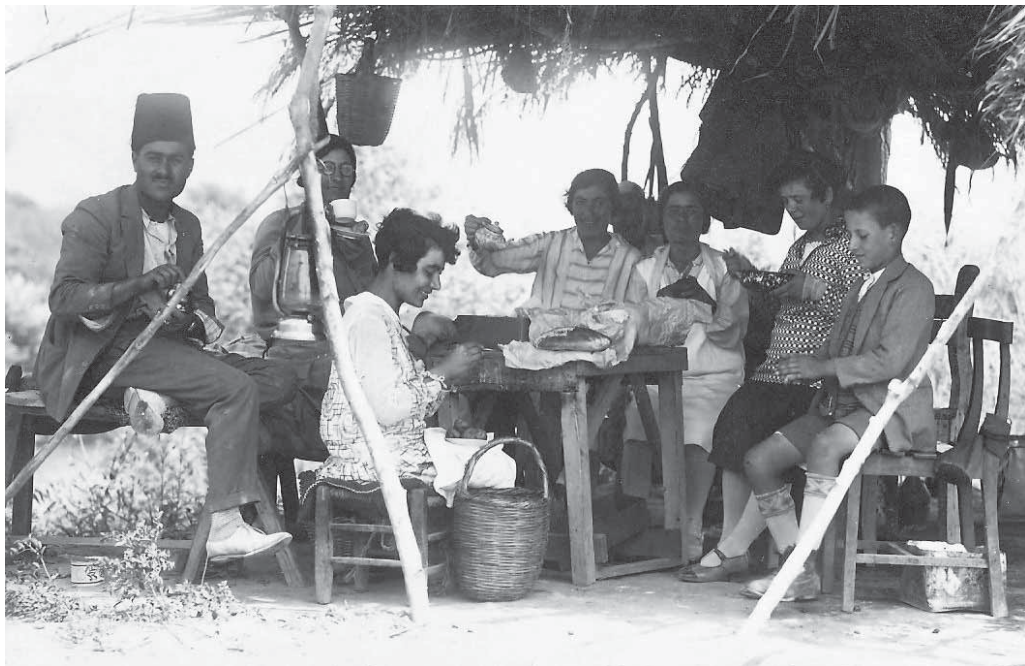
Picnic, undated.