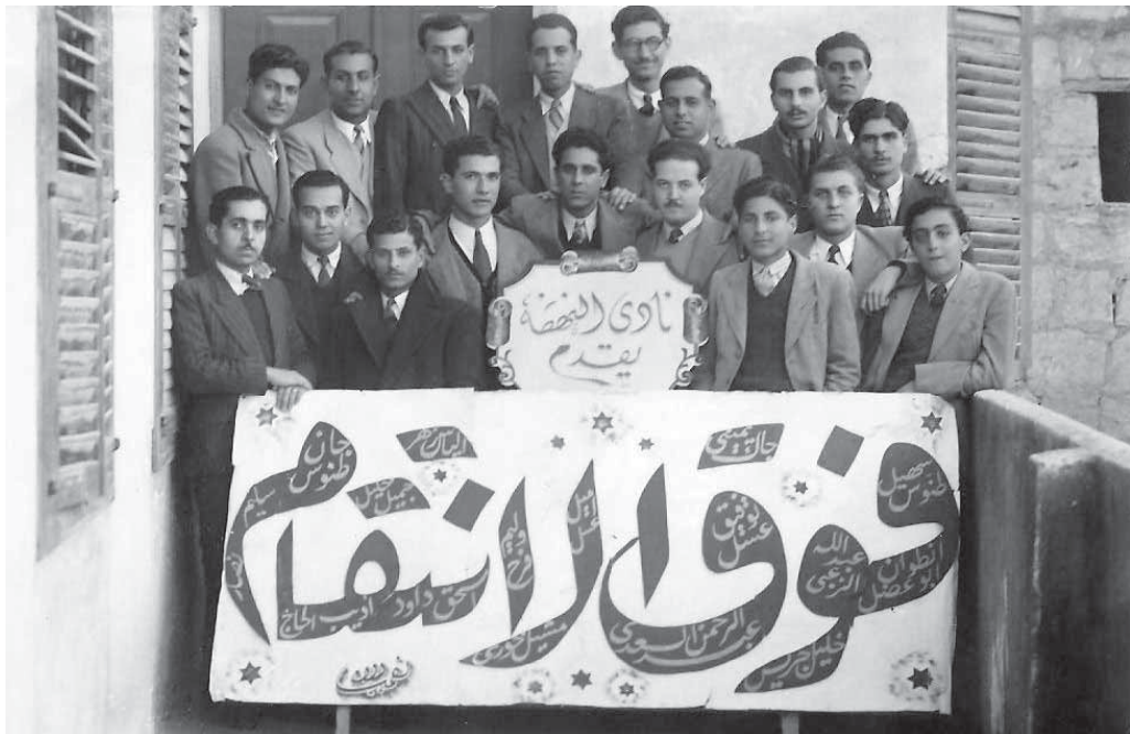
Nahda Theatrical Group and Literary Club, Nazareth, 1946.