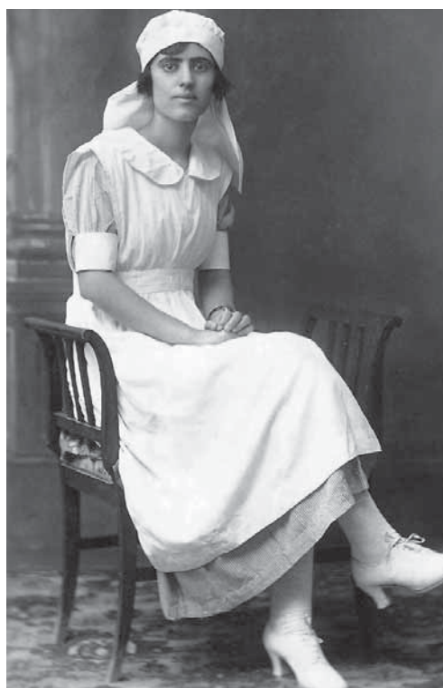
Nurse in Acre Government Hospital, undated.